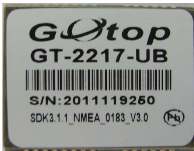
Figure 1: GT-2217 -UB Top View